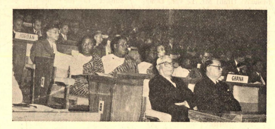
A view of the delegates on the opening day

The Conference notes also with satisfaction the useful role which is being played by the I.F.A.P. in bringing about collaboration between farm organisations in more than thirty countries and acting as their voice on the international level. It hopes that as progress is achieved in the establishment of nationally representative farm organisations, more countries will join the Federation. It thanks the I.F.A.P. for their helpful collaboration in making this Conference a success.